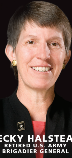
BECKY HALSTEAD RETIRED U.S. ARMY BRIGADIER GENERAL