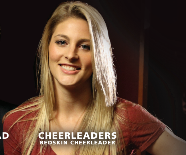
CHEERLEADERS REDSKIN CHEERLEADER