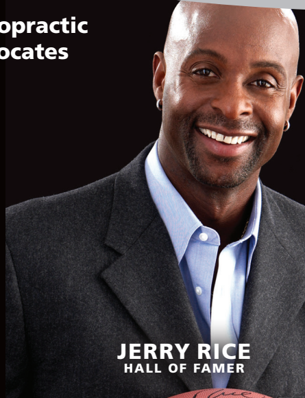
JERRY RICE HALL OF FAMER