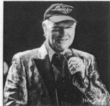
Beach Boys founding member Mike Love.

And while many older adults seek chiropractic care for its high patient satisfaction scores and relief from musculoskeletal pain, chiefly back and neck pain, that's not all they're consulting such doctors about. The same C&MT arti-